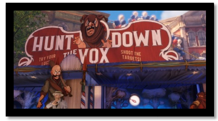
An anti-Vox carnival game in the opening sequence. Figure 5

by the wreath of American flags which hug the epigraph "It is our holy duty to guard against the foreign hordes". These "foreign hordes" flank Washington on all side, each a stereotypical representation of Chinese, Native American, Jewish, Hispanic, and Irish immigrants to Columbia. Each of these ethnicities were marginalized in the early 1900's and this image, like the interracial couple at the raffle, helps reinforce the idea that Columbia is thematically linked with the time period it is set in. We also see four symbolic representations of Columbia's ideals, a cross for Faith, arrows for Defense, wheat for Prosperity, but for Purity we see a raven. The raven is a nod to the Order of The Raven, which is Columbia's version of the Ku Klu Klan, again reinforcing Columbia's racist/xenophobic tendancies. So