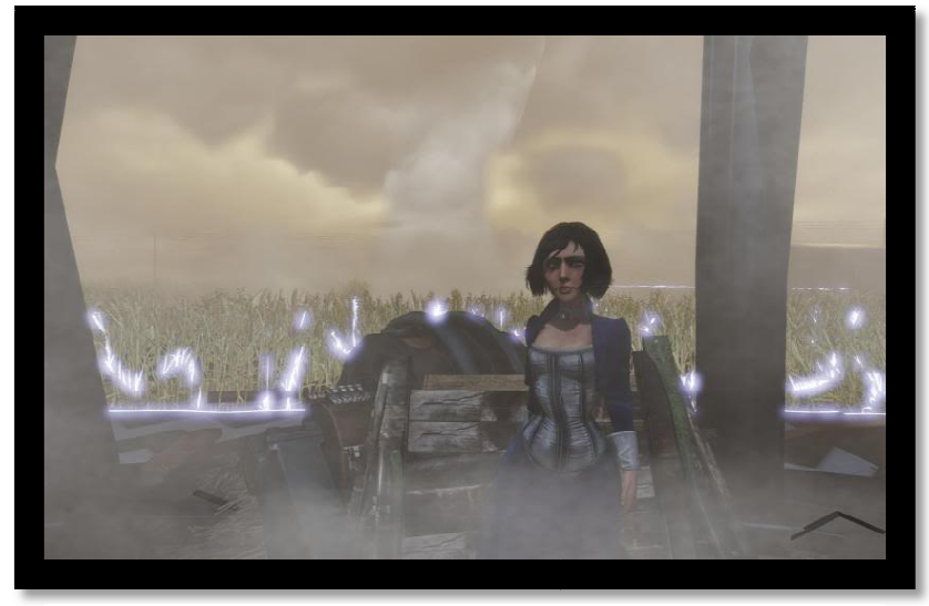
Elizabeth displaying her power at Comstock House. Figure 9

characters, she has a dynamic arc that forces the audience to watch her succumb to the destructive forces of Columbia. As a character, we see her at her lowest lows, and witness first hand as she bears the burden of her powers. Watching Elizabeth's development over the course of Infinite affords its audience ample opportunity to empathize and create a connection with her, and whether it is watching her meet other people for the first time, or her distress as she witnesses someone lose their life right in front of her, these connections certainly make her a dynamic, life-like character that evokes a aesthetic