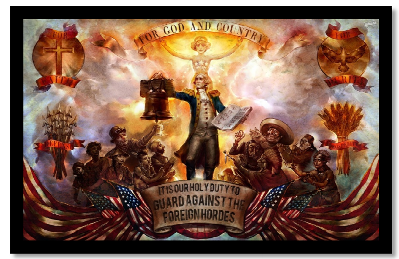
The mural in the Hall of Heroes. Figure 4

sometimes even the most out-of-place image addresses many of Infinite's major themes. One such image is a mural of George Washington found in the museum of Columbia's achievements, the Hall of Heroes. In this one image alone, we can dissect many of the major themes at play in Infinite's narrative, but also discover what kind of place Columbia is. In the mural, George Washington stands holding both the Liberty Bell and the Ten Commandments, showing Columbia's commitment to both Religion, as we saw with Comstock, and to the ideals of American Exceptionalism. This is further supported