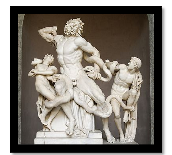
Laocoon and His Sons. Figure 1

Lessing's thesis in Laocoon informs us how the difference between the renderings of artistic products in different mediums fundamentally change the experience of the audience, and it is because of this that we must adopt a new set ideas of what art is capable of doing, and by extension what video games are capable of doing. Lessing first discusses the sculpting of Laocoon and His Sons (Agesander of Rhodes, 27 BCE-68 CE; Fig. 1.) and how that even though Laocoon is experiencing great physical pain, his face reveals an "opposed and weary sigh", not the ugly contortions we would recognize with such a gruesome tale (Lessing, 1766/2012). Lessing asserts that this is because the sculptor was working for the beautiful perfection of his subject, despite his pain, and Lessing "merely wished to establish the fact that with the ancients, beauty was the supreme law of the plastic arts" (Lessing, 1766/2012). Poetry, as a medium, produces and altogether different effect, however, with Virgil's Laocoon in the Aeneid shouting