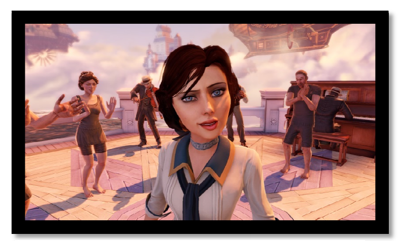
Elizabeth after your first break out of her prison. Figure 7

with other people. All in all, Elizabeth does the things that you would expect someone locked up in a tower their entire life to do. This thoughtfulness on the part of the design team really helps accentuate the parts of Elizabeth that make her "real", since her actions are not just poignant, but they make sense given her prior circumstance, which makes it easier to empathize with her. One such event occurs with Elizabeth and Booker happen upon a guitar in a basement, between one of their skirmishes with the Columbian police. Elizabeth points out the guitar and remarks that she wishes she "knew how to play". At