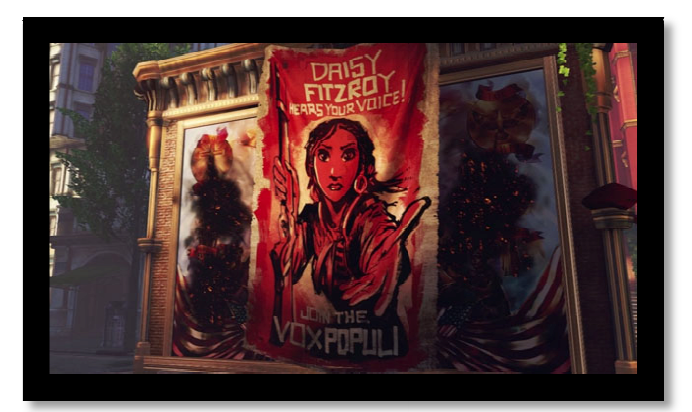
Vox propaganda over a destroyed version of the Hall of Heroes mural. Figure 6